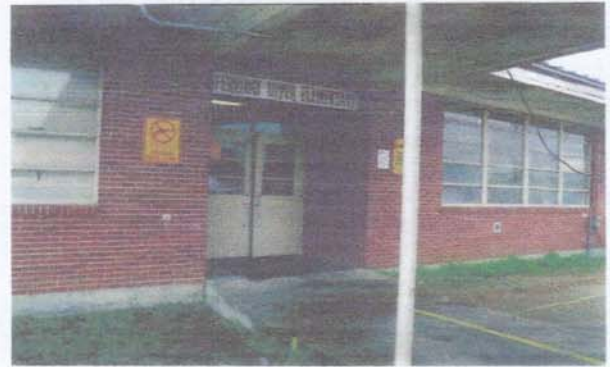
Entrance into school for student and visitors.

12A • October 20, 2010 Concordia Sentinel