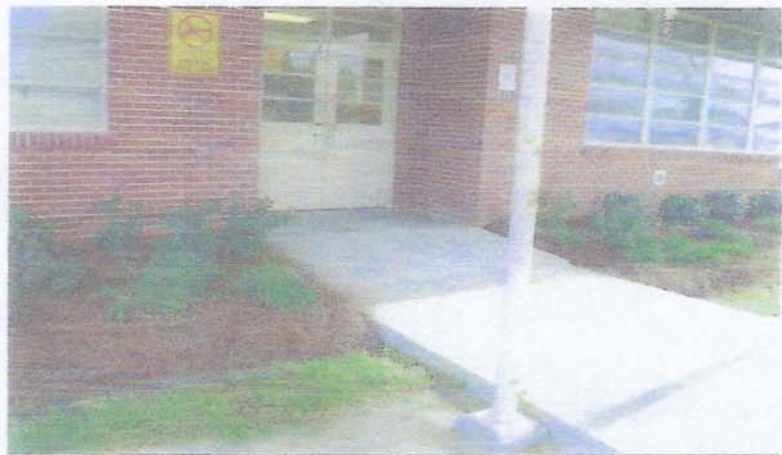
KNOCK OUT ROSES AND STELLA DE ORO ADD COLOR TO ENTRANCE