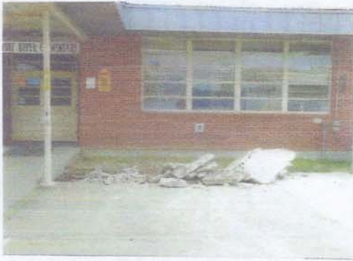
Before – Large amounts of concrete had to be removed