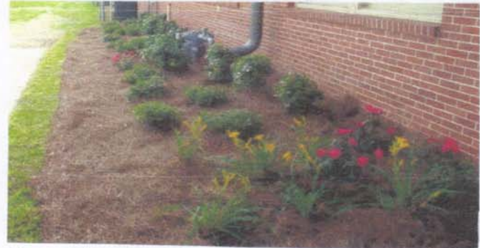
"Wow, A Job Well done"